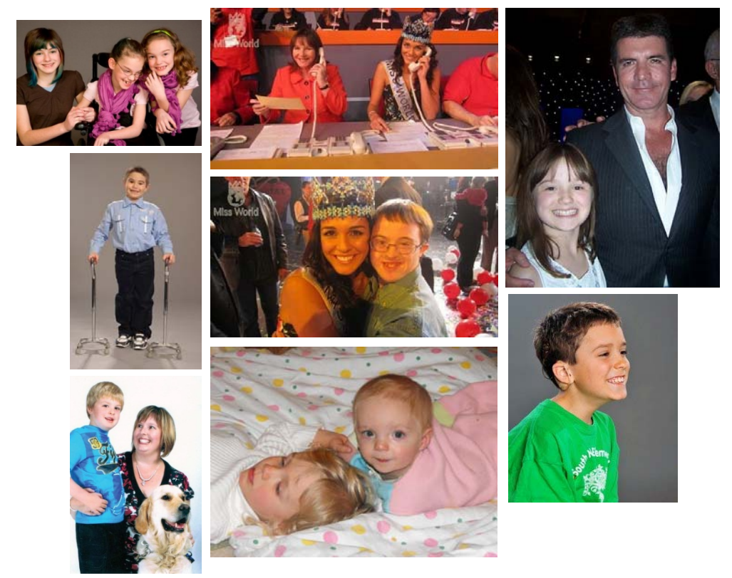
Miss World Canada & its Delegates have changed the lives of so many children in need! Variety Pageants have raised over $260,000 for Variety-The Children's Charity.

Variety disburses much-needed funding to children and their families throughout BC through individual grants and the Emergency Response Fund. Every year, Variety disburses over 1,300 grants for medical emergencies, therapies, specialized equipment, drug prescriptions, and out-of-town accommodation and travel costs. Variety also provides grants to children's organizations for construction, renovations, equipment, and program costs.